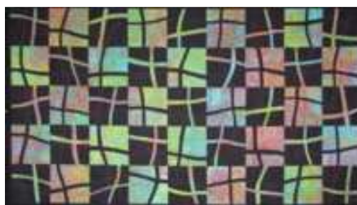
Another Indicative Sample - Fishnet