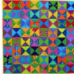
For Finn Hourglass Blocks (ideal for charm squares)