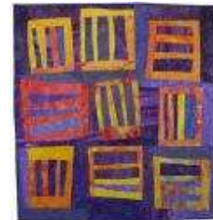
Firebrand Improvitational Piecing

Sewing Machines will be provided by sponsor companies so you don't need to bring your own. A technical assistant will be available in class to assist any students who are unfamiliar with that machine. If you prefer to bring your own sewing machine , you may. Ensure it is well maintained and that you also bring the instruction manual and accessories, and bring your 1/4" foot. Appliqué projects will also require an open-toed embroidery foot. Foundation quilting projects using batting will require a walking foot.