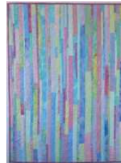
Prettily Pastel Foundation Piecing