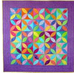
Spring Petals Fusible Web Appliqué