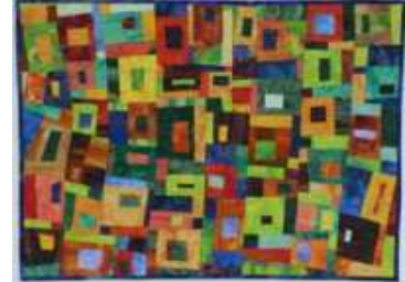
Autumn Splendour Improvitational Piecing (Multi-width strips)