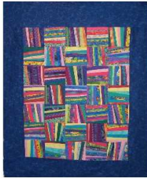
Springtime String Piecing (ideal for strips)