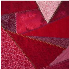
Crazy Red Crazy Patchwork