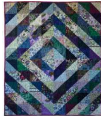
Floral Diamonds Half Square Triangle